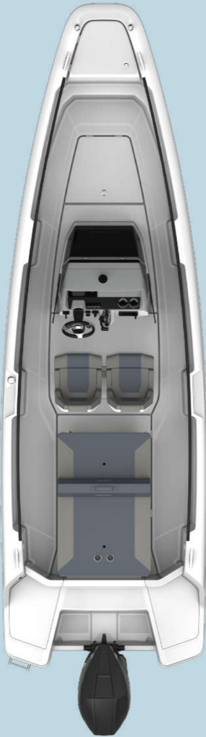
Axopar 22 Spyder Multi-storage configuration with optional Multi-storage cushions with harbour cover