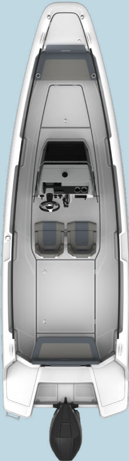
Axopar 22 Spyder Standard aft sofa configuration with optional front deck seat incl. cushions with harbour cover